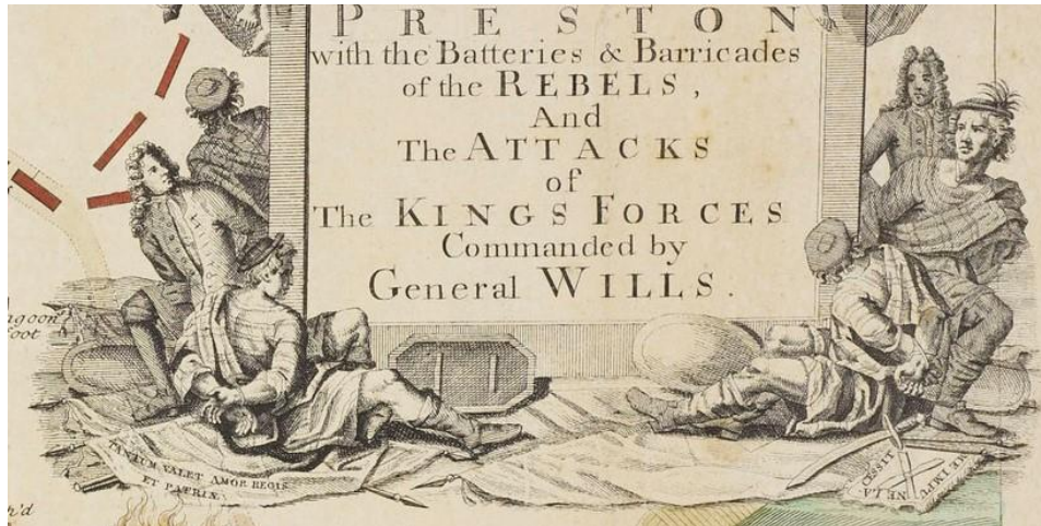
Detail of map cartouche from A Map and Plan of the Town of Preston, Abel Boyer, c.1715